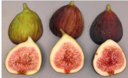
BROWN TURKEY FIG MATURITY