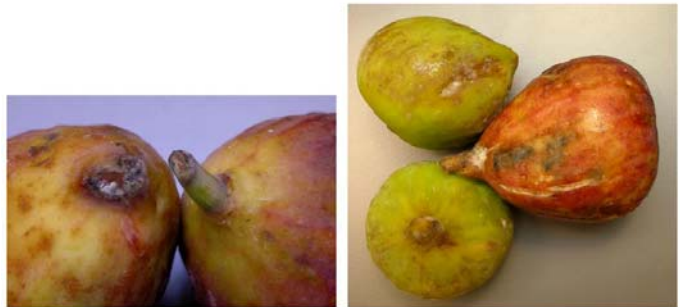
DECAY FOLLOWS PHYSICAL DAMAGE