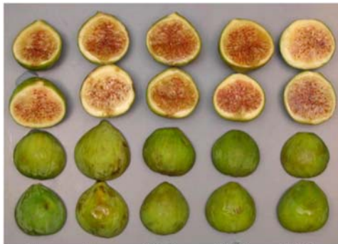
Air 0°C Air 5°C 3%O 2 + 6%CO 2 3%O 2 + 12%CO 2 3%O 2 + 18%CO 2