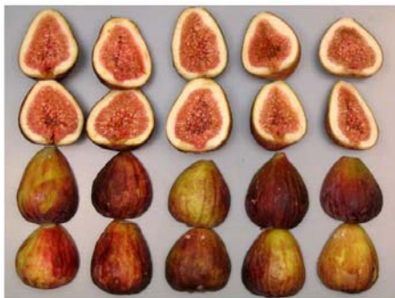
Air 0°C Air 5°C 3%O 2 + 6%CO 2 3%O 2 + 12%CO 2 3%O 2 + 18%CO 2