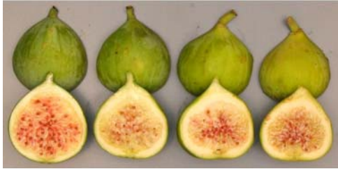
SIERRA FIG MATURITY