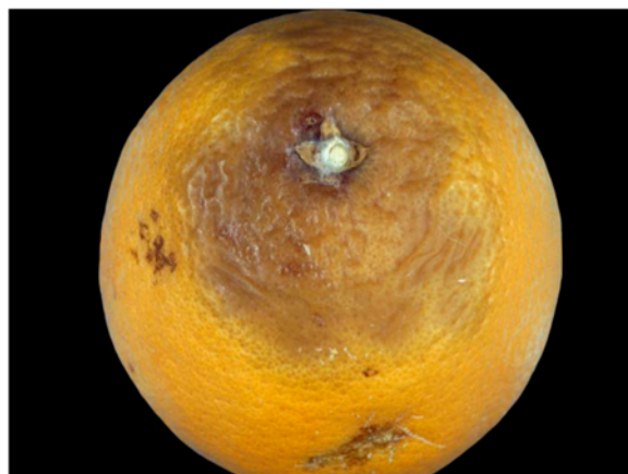
PHOMOPSIS STEM-END ROT