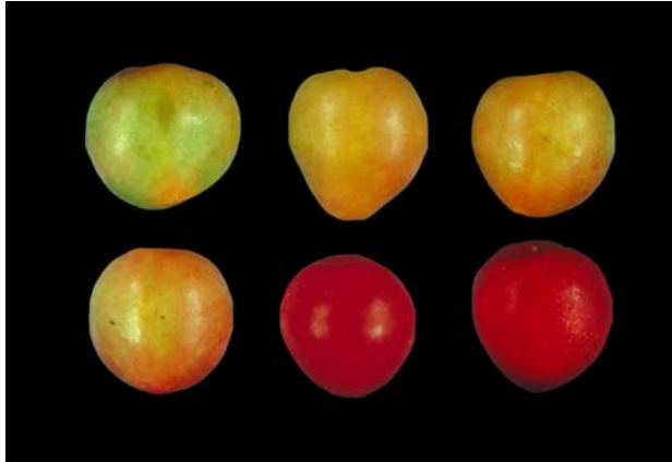
PLUMS RIPENESS STAGES